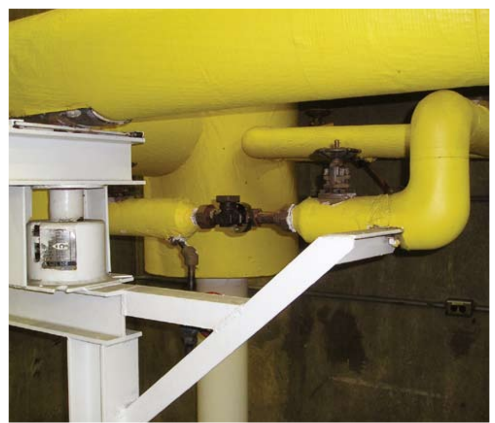
A steam trap.

Technicians who use ultrasonic detectors on a daily basis can achieve accuracy that exceeds 98%. And regarding frequency of inspections, process components of equipment, as well as drip main stream traps should be checked twice a year. Heating steam traps (in facilities that use steam for space heating) should be tested annually and instituting a reporting system to keep tabs on the location, type, size, capacity and condition of all traps in a steam system is imperative.