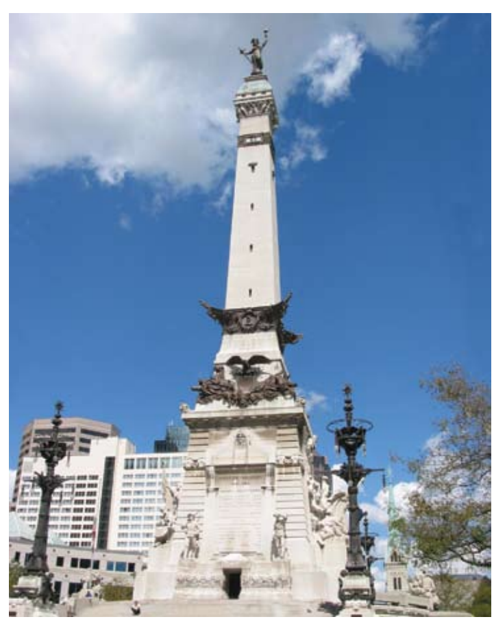
The Soldiers' and Sailors' Monument is now heated and cooled by Citizens Thermal Energy thanks to a recent chilled water expansion. A 150-foot directional bore under Monument Circle allowed for the installation of new chilled water lines.

"Silt from the well water has been creating a lot of maintenance problems for our old chiller. We've also begun to have problems regulating humidity in the Civil War Museum. The decision on how to replace our cooling system was bigger than your normal business deal. By partnering with Citizens Thermal Energy. we eliminate the maintenance hassles of the old chiller and get precise humidity control vital to preserving the many artifacts in our museum," said