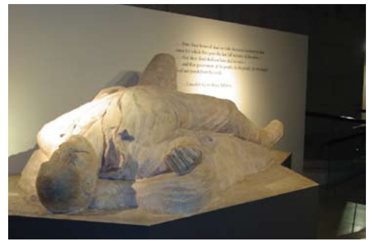
A sculpture of a fallen soldier lies next to a quote from Abraham Lincoln.

The addition of the Soldiers' and Sailors' Monument to the chilled water system now means Citizens Thermal heats and cools most of the facilities across the expansive Indiana War Memorial Plaza Historic District, the nation's largest monument district honoring veterans.