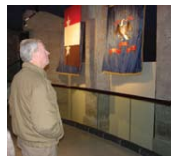
Brigadier General J. Stewart Goodwin admires the regimental battle flags that hang inside the Colonel Eli Lilly Civil War Museum located inside the Soldiers' and Sailors' Monument. Precise climate control provided by Citizens Thermal Energy is vital to preserving the many priceless artifacts inside the museum.

recent system expansion under Monument Circle. Monument officials chose CTE chilled water rather than replace an aging chiller that utilizes water drawn from a well deep under Monument Circle. The facility has been heated by CTE steam since 1924.