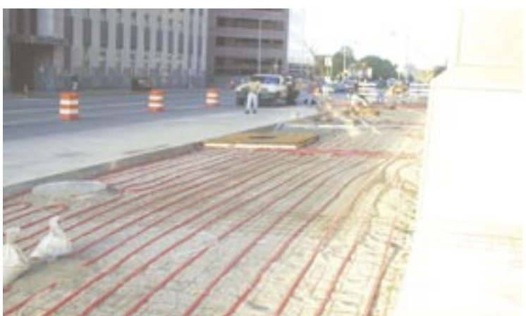
A snow melt system is installed in the sidewalk at 300 North Meridian Street in Downtown Indianapolis. A similar system is planned for the front entrance of the expanded Indianapolis Marion County Central Public Library currently under construction.

pumped through the coils in the sidewalk at a rate adequate to keep the surface of the sidewalk just above the freezing point. The heat source for the heat exchanger is typically steam supplied by Citizens Thermal Energy in the downtown business district or may beprovided by a natural gas-fired hot water boiler if district steam is not available. The systems also typically keep the surface dry by evaporating the moisture that does collect on the sidewalk.