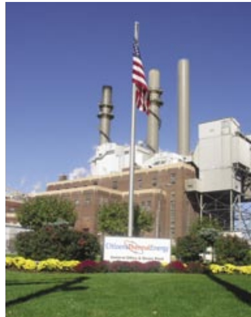
Citizens Thermal Energy's Perry K Steam

In order to develop a comprehensive, long-term compliance plan, Citizens Thermal Energy has hired an outside engineering firm to assist with the evaluation of the regulatory programs and the status of the steam plant with respect to each