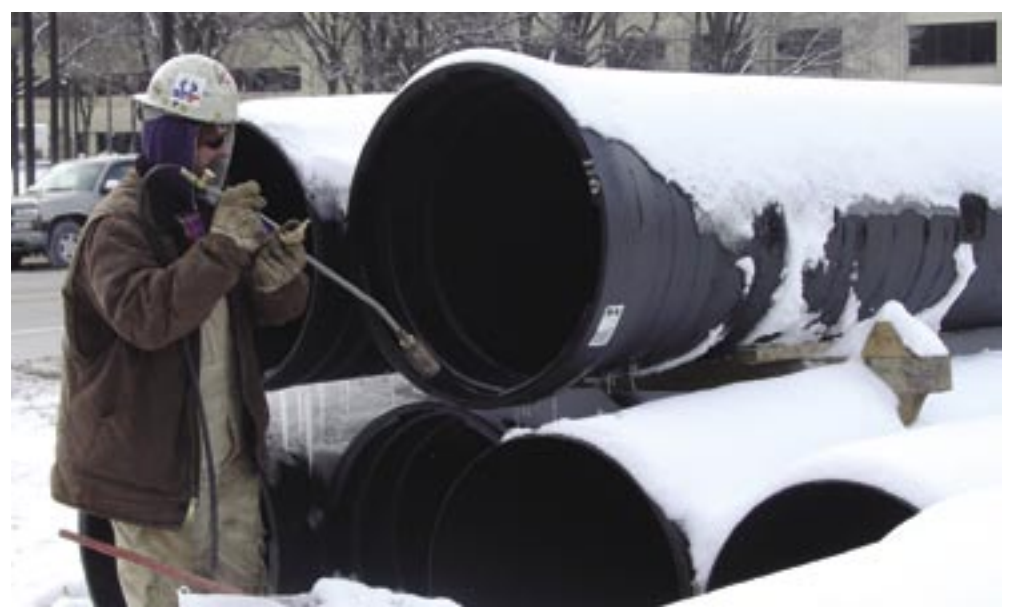
A worker uses a torch to thaw ice that has formed on a section of iron pipe for the chilled water expansion.

"The current expansions are the first of several system expansions we expect to complete in the near future. We know providing low-cost heating and cooling services is a major factor for continued economic growth across Downtown Indianapolis. Our low-cost energy services help existing Downtown entities grow and are a key factor in helping the city attract new business and industry," Tracy concluded.