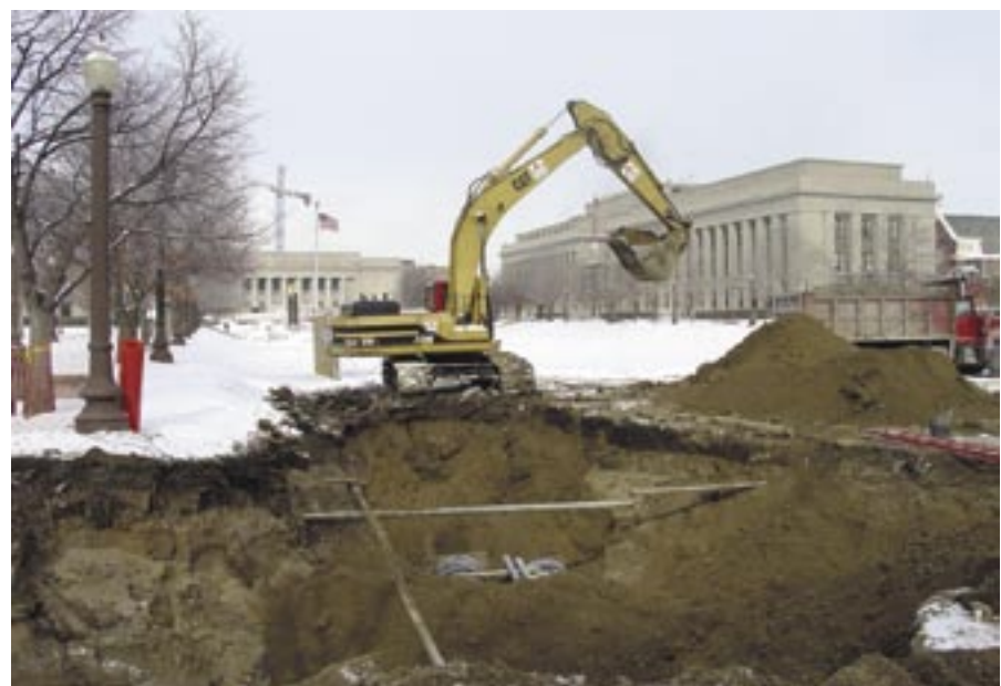
A backhoe digs another trench for two 30-inch diameter ductile iron pipes that will carry chilled water to the National Headquarters of the American Legion and the Central Library Branch.