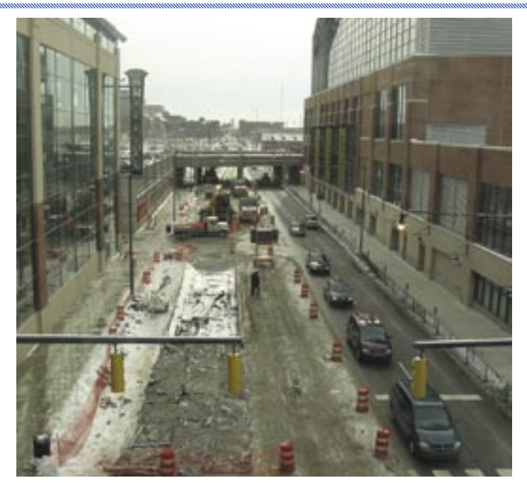
Keeping traffic moving is an ongoing challenge during the chilled water system expansion near Conseco Fieldhouse.

Citizens Thermal Energy also is expanding its chilled water system south from the Downtown business district area towards the Lilly Corporate Center campus. Two 36" ductile iron pipes are being installed south along Delaware Street. This construction