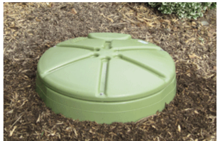
Above: Surface view of the Grinder Pump System (post-installation)

*Even products labeled as "flushable" can adversely impact your grinder pump system.