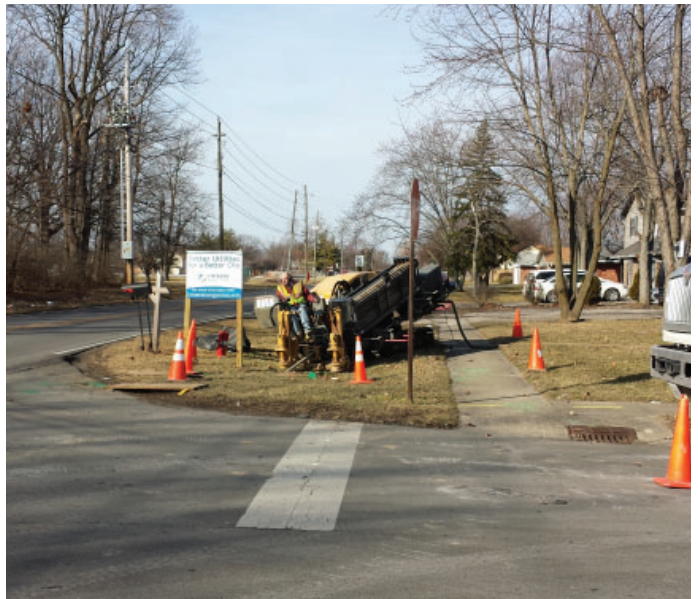
Above: Directional boring machines allow pipe to be installed under streets without disruptive street cutting and excavation.