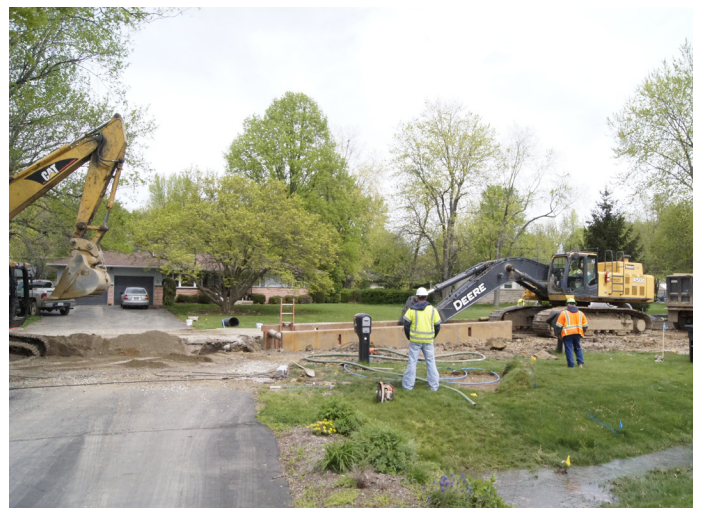
Typical Construction Area