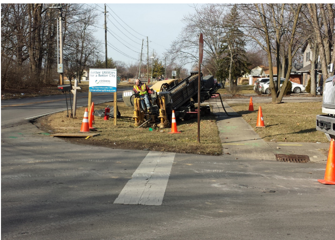
Acung: Dingteolei vihnak seeh hna nih tipep hna cu lam tannak hnahnawhpeknak le cawhnak um loin lam tangah bunh kha a onh.