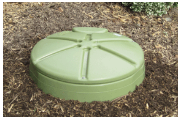
Rialtu Dawpnak Zohnak Muihmai (bunh-hnu)

Lei cungah dawpnak thil pahnih lawng a um lai: theihternak kelamh le a chin. Theihternak kelamh cu awl te in a luh khawh naknga khuati-zohnak bawm ah on an si. Rialtu dawpnak chin cu diameter in 26 lehmah hrawng asi i vawlei in lehmah pa 2 hrawng a sang. A chin cu sii thuh khawh asi/asiloah thingram in thuhnawh khawh asi. A chin cu sii thuh khawh asi/asiloah thingram in thuhnawh khawh asi.