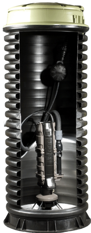
Rialtu Dawpnak Tannak (bunh-hlan)

Tha tein na tonghto ahcun, abuaktlak cun kum 20 a nguh.