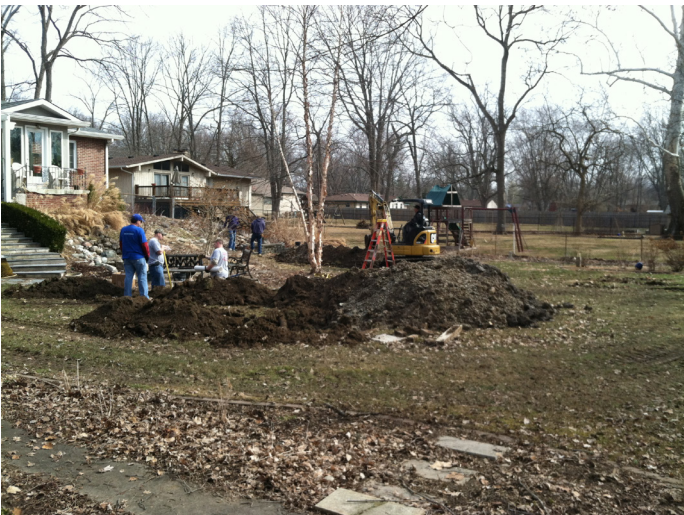
Acung: Rialtu dawpnak cu bunh lio asi. Hi zohnak nih phunningin bunhnak caah kachamsernak aherhmi a langhter.

Man he pehtlaiin umek theihngalhnak caah, zaangfahnakin kahin leng: www.CitizensEnergyGroup.com/Notices Tihnam Sining le Dirhmun caah theihternak.