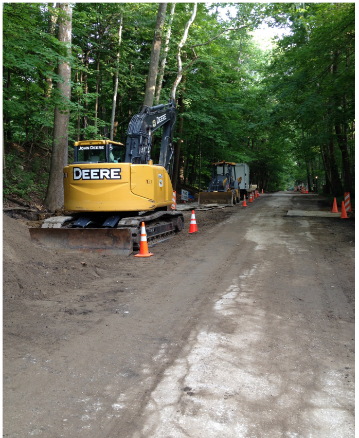
Phunninglei STEP saknak hmun lam zohnak.