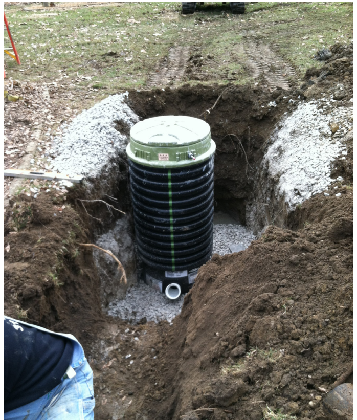
Acung: Kahin kahcham ah rialtu dawpnak zohnak a um. Hi cu pep tibunh, kahcham kha vawlei in chilh le a hmun ruanter hlan i asi.