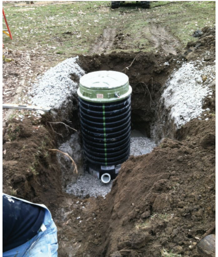
Above: Here is a view of the grinder pump system in the trench. This is prior to piping, refilling the trench with soil and leveling of the site.